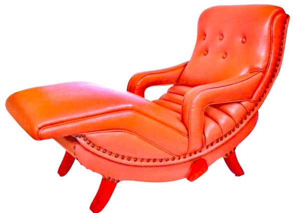
Orange Lounge Chair