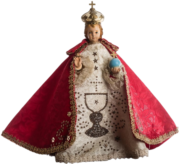
Baby Doll Jesus